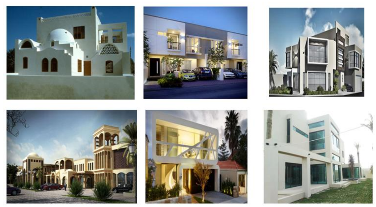
Figure 1: Traditional Facades VS Modern Building Facades (Source: the author).