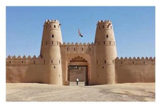
Figs. 6: The Al-Jahili Fort demonstrates local building traditions (Source: the author).

On good example is Al-Bahr Towers in Abu Dhabi, which was influenced by the traditional fort Al-Jahili in Al-Ain in UAE shown in Figure 6. The brief outline of the project " The building should reflect its prestigious status, contribute to the surrounding environment and take into account the architectural heritage of the UAE and Abu Dhabi in particular. A contemporary building utilizing modern technology is required, which should be recognized as one of the landmarks associated with the city of Abu Dhabi." [20]<sup>5</sup>.