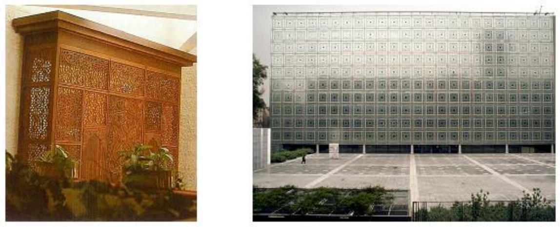
Figs. 4: Modern interpretation of traditional Elements.

Among these technologies used nowadays by architects and designers for facades is kinetic façade. - Kinetic facades