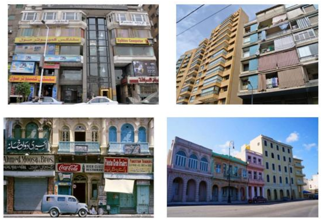
Figure 3: Illustrations show visual pollution in Building Facades.

- Advertisements and banners have their strongest effect due to their various positions, sizes, shapes and directions (figure 3).