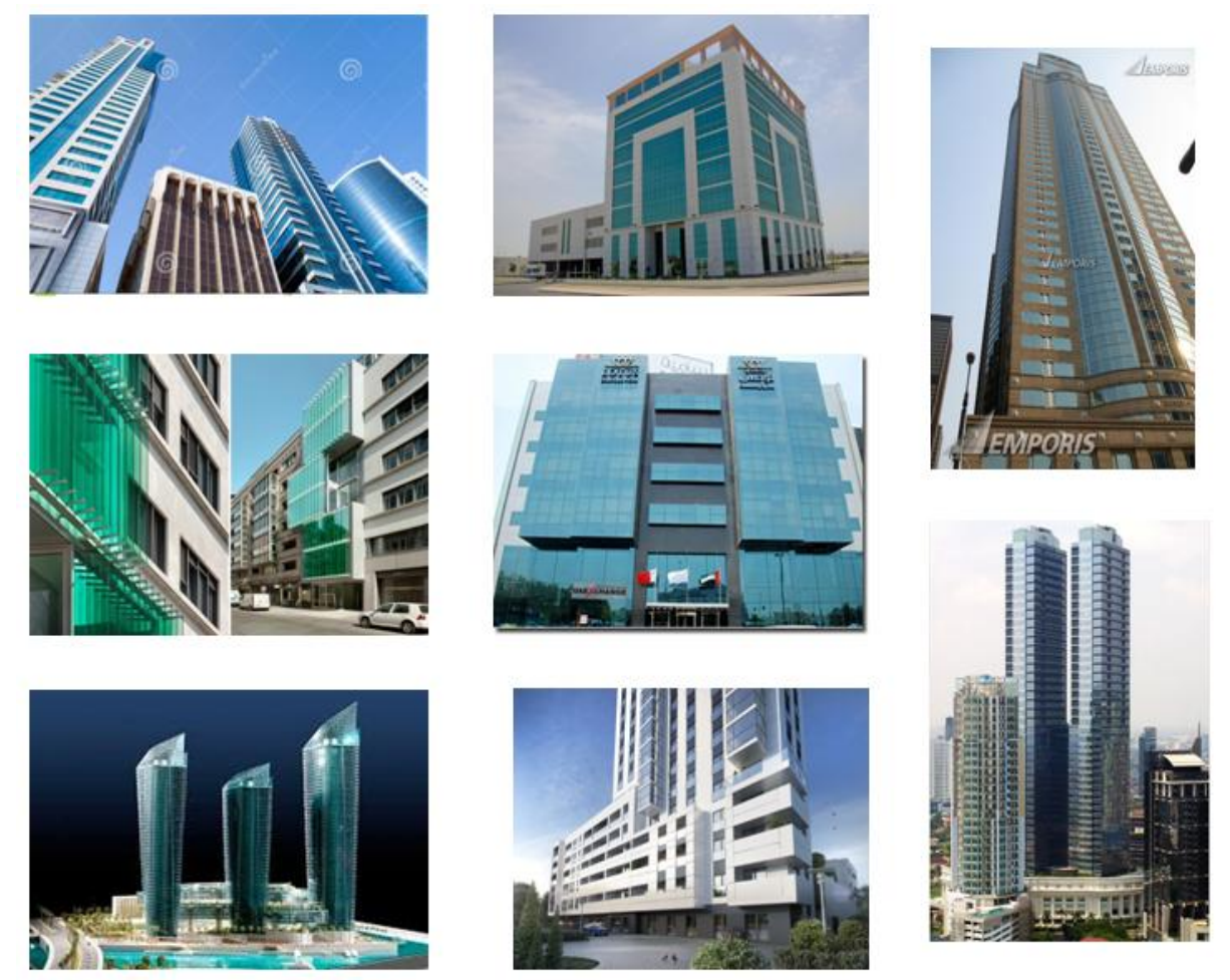
Figure 2: Illustrations show Building Facades in different countries