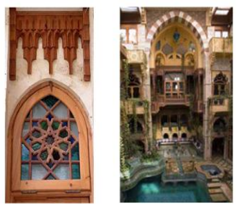
Figure 10: Al Makkkiyah Residence (Source: Aga Khan Award for Architecture, 2007 Award Cycle).